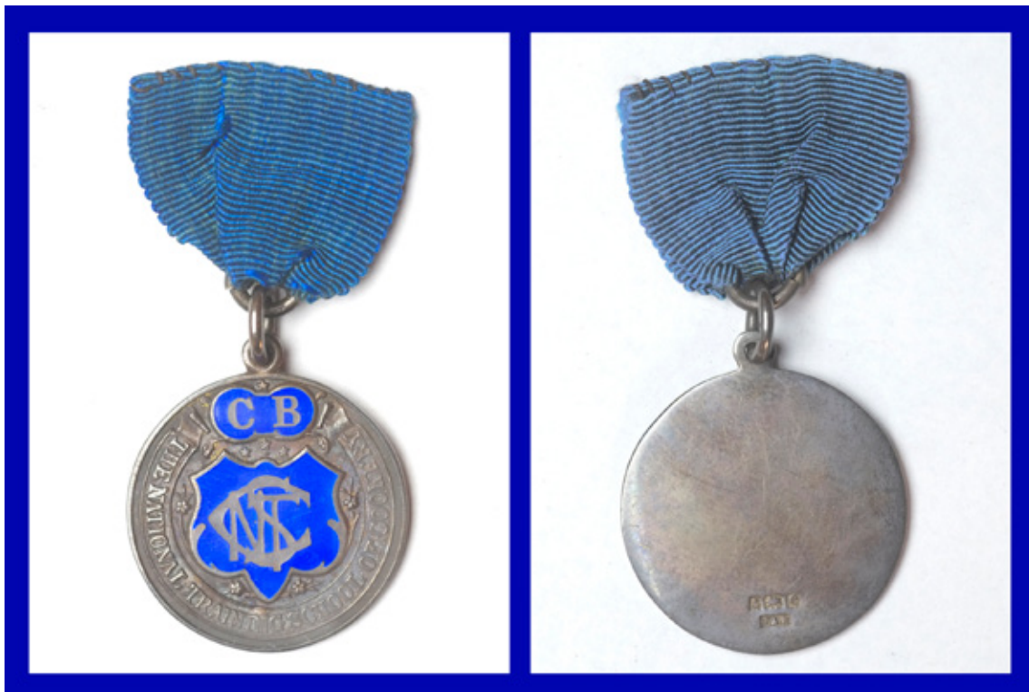
Florence Cresswell's Cordon Bleu Medal – See p.16