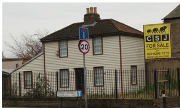
70 Christchurch Rd Colliers Wood; (above left: before renovation; above right)

Other developments which have featured in online groups are the West Barnes/Worcester Park gasholders and the surrounding greenspace, Majestic Way, Mitcham and Colliers Wood towers.