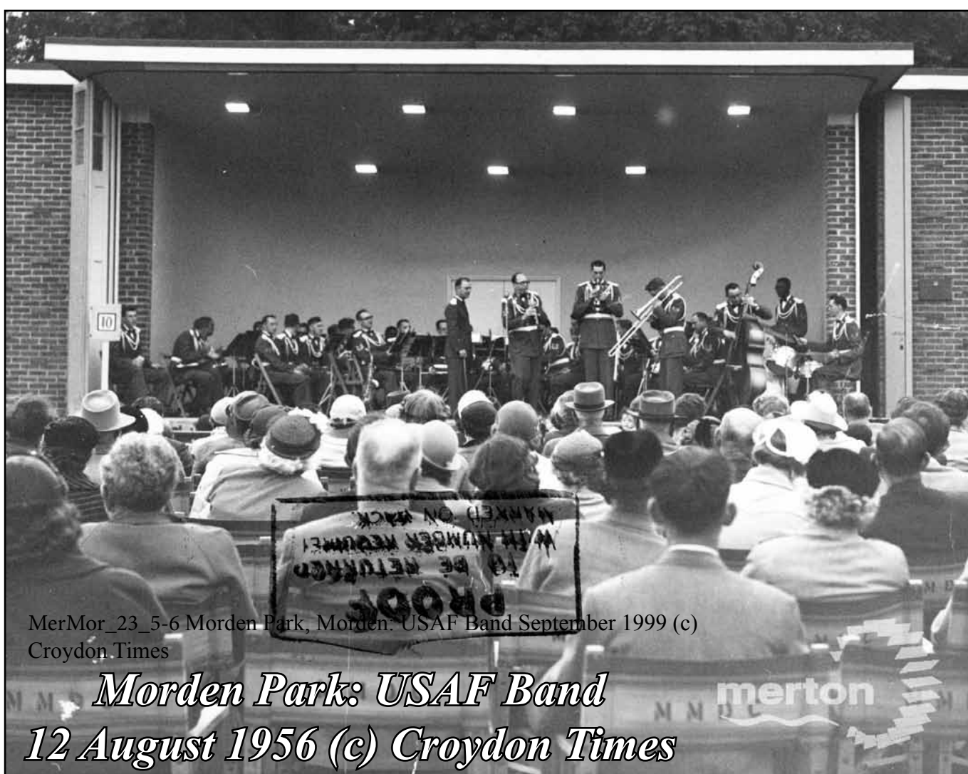
MerMor_23_5-6 Morden Park, Morden, USAF Band September 1999