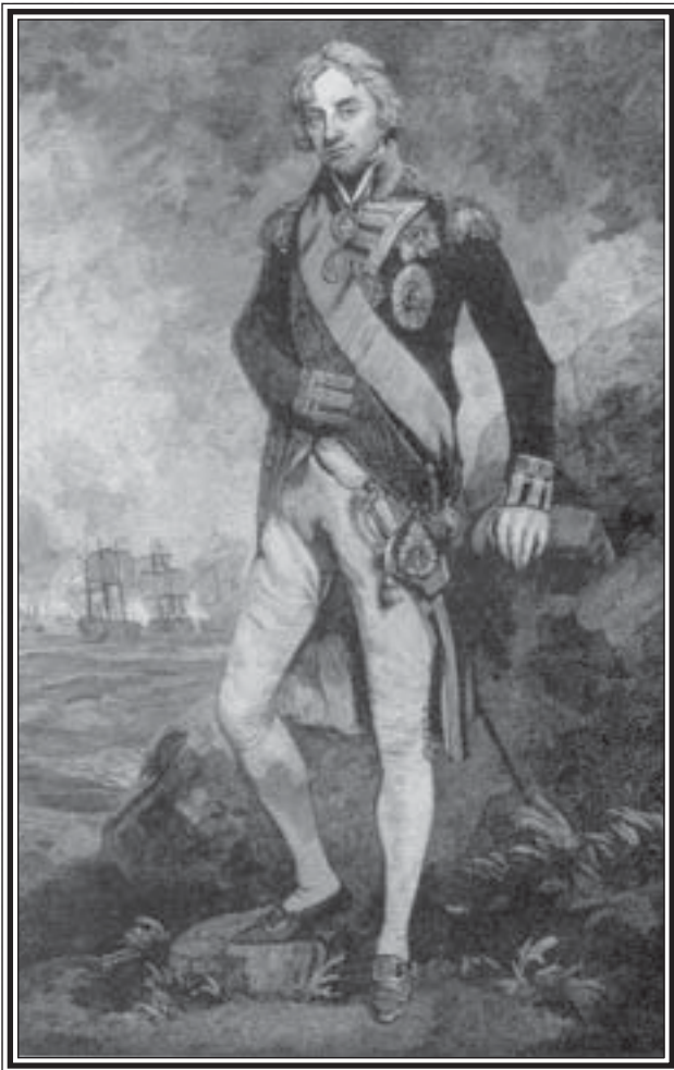
Nelson, a print from a portrait by John Hoppner 1800-01

Late in 1800, Nelson, aged 42, had come home from the Mediterranean on leave from harassing the French fleet. He had lost his right arm (1797) and the sight of his right eye (1794), but he had risen to be Rear Admiral of the Red, and had been created a baron after his victory at the Battle of the Nile. The King of Naples had gratefully conferred on him the title Duke of Bronte, in Sicily.