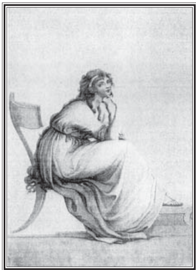
Emma, a print from a drawing by Frederick Rehberg 1794

However, now Emma was pregnant with Nelson's baby. Her height (she was a tall woman), her plumpness (she was no longer Romney's slender model) and the new loose, flowing fashions helped to disguise her condition, but there was plenty of gossip. There was gossip too about Nelson's dismissal of his wife Fanny. She was a quiet, ladylike woman; she remained devoted to him and behaved throughout with dignity and restraint.