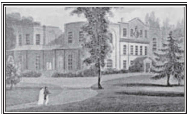
Merton Place Nelson's hatchment hangs on the front.