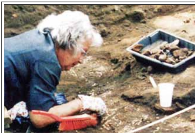
Excavating at Abinger Roman villa in 1995

Her interests lay particularly in rescue archaeology, whether prehistoric, Romano-British, or medieval; she was well-known for her work at Rapsley Roman villa. She was for more than 30 years a pillar of Surrey Archaeological Society, both on the Council, and as an energetic member of the excavations committee from the mid-1950s, a period when amateur and rescue excavation was far more prevalent than today. It was the excavations carried out in 1962-63 at Merton priory and published in the Surrey Archaeological Collections that drew her attention to this area. She advised or commented upon several of our digs in the 1960s, being always very supportive and encouraging to others.