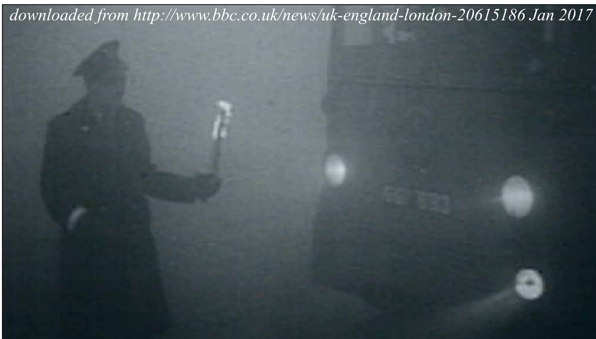
downloaded from http://www.bbc.co.uk/news/uk-england-london-20615186 Jan 2017

One day the smog was so bad that I couldn't find my way home from my friend's house in Shaldon Drive to my house in Cardinal Avenue! We had travelled home from work together.