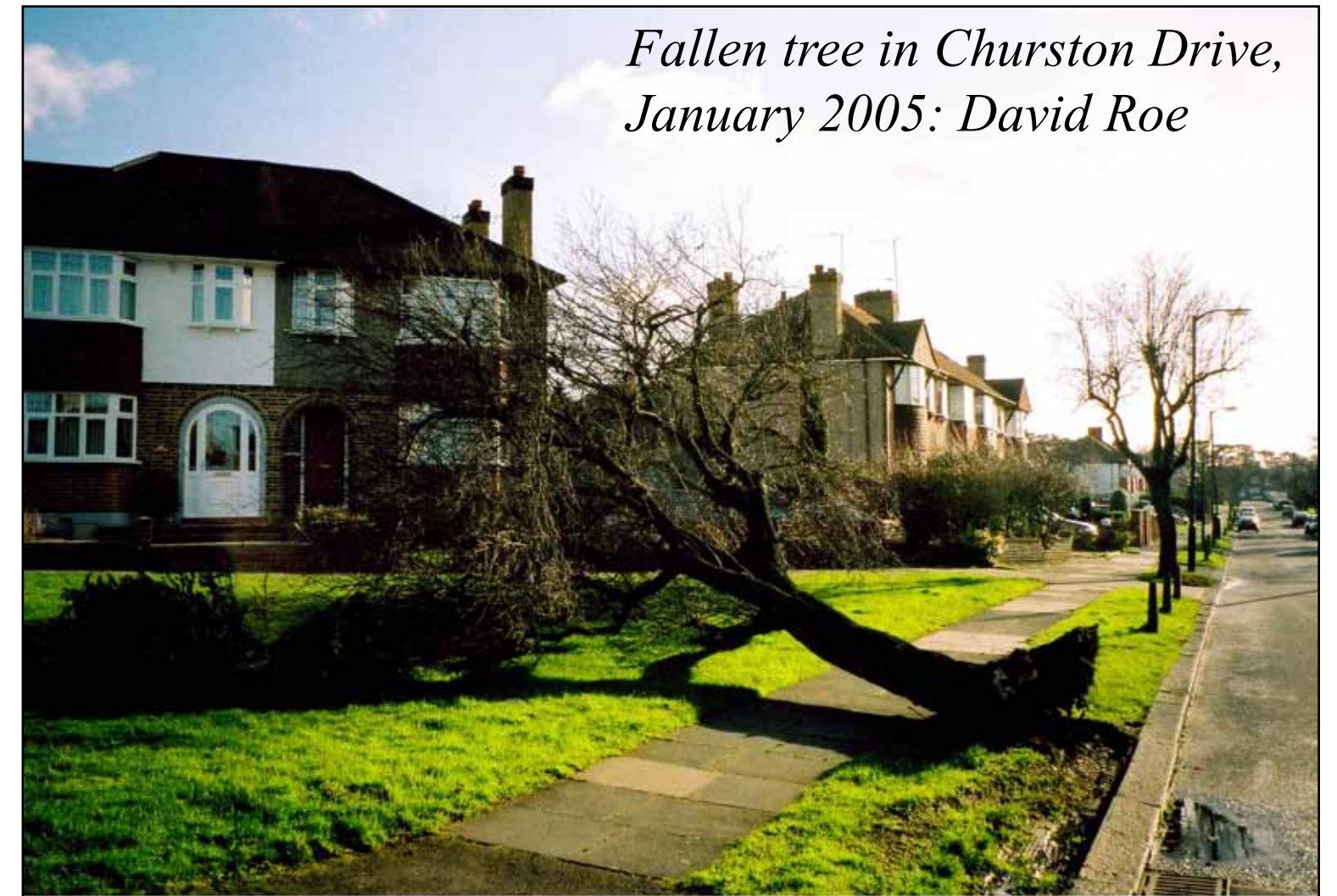
Fallen tree in Churston Drive, January 2005

Please share your memories. There are plenty of blank speech bubbles!