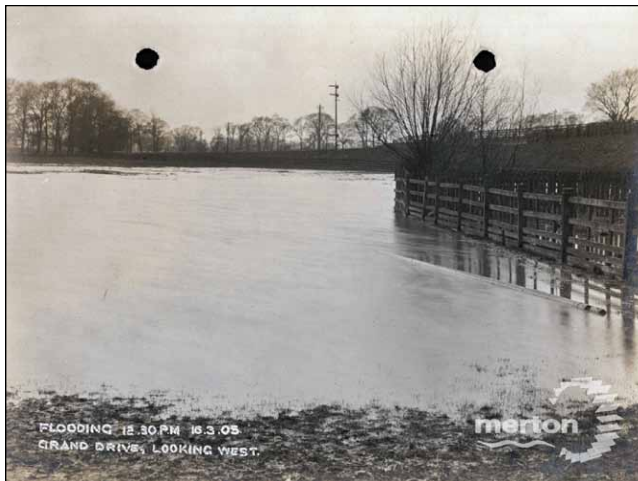
FLOODING - 12.30 PM 18.3.05 GRAND DRIVE, LOOKING WEST.

Around 1930 it was Lower Morden Lane outside Battersea New Cemetery, now the North East Surrey Crematorium, that was under water. The Pyl brook crosses the road nearby.