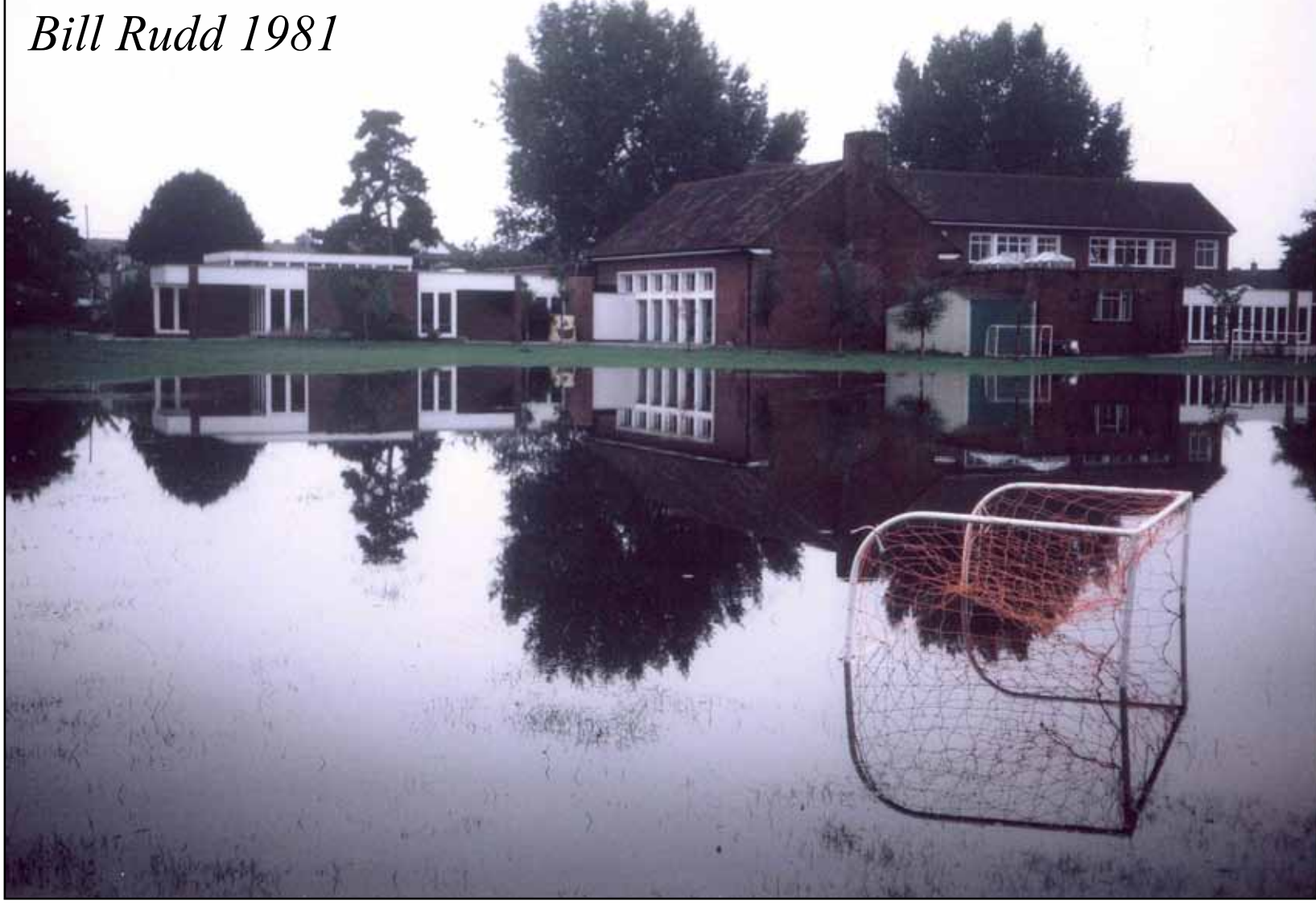
Bill Rudd 1981

In August 1981 heavy rain swelled the normally tranquil East Pyl brook, which was blocked by debris. It soon overflowed its banks, causing a flash flood which devastated Hatfeild School.